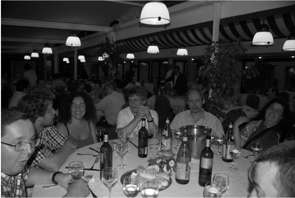
Fig. 11. Dining together was an important feature of the conference.