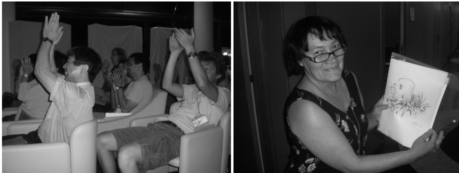
Fig. 3. Cultural event (opera). However, there were artists directly among the participants.