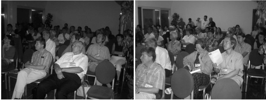
Fig. 1. Scientific talks: the discipline of conference participants in attending was great.