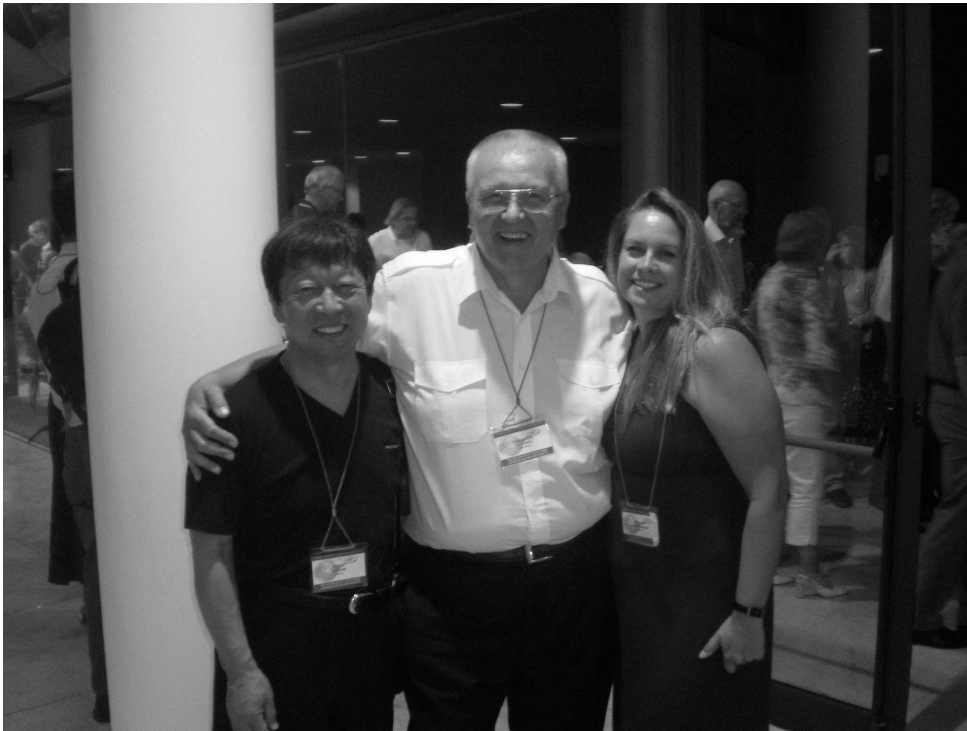
Fig. 6. New friendships were established in Palermo.