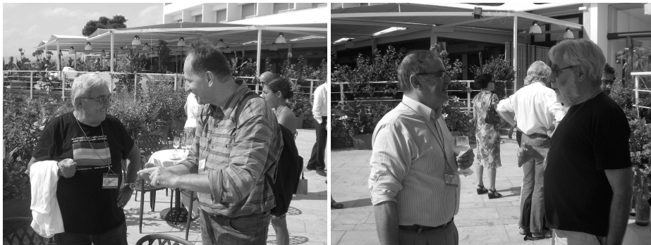
Fig. 10. Discussions.