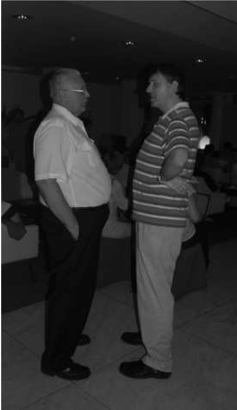
Fig. 7. Discussions.