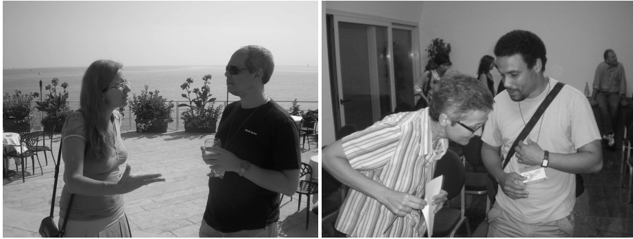
Fig. 8. Discussions.