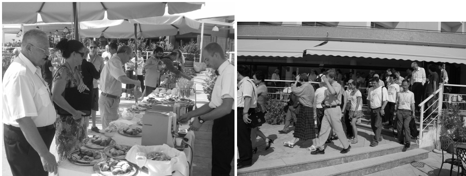
Fig. 4. Coffee breaks were great with delicious italian coffee and pastry.

are still (very) controversial: e.g. SS Cyg (magnetic or non-magnetic) and AE Aqr (TeV source yes or not).